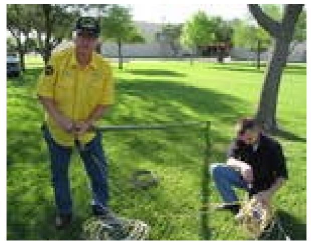
Dipole antenna set up.